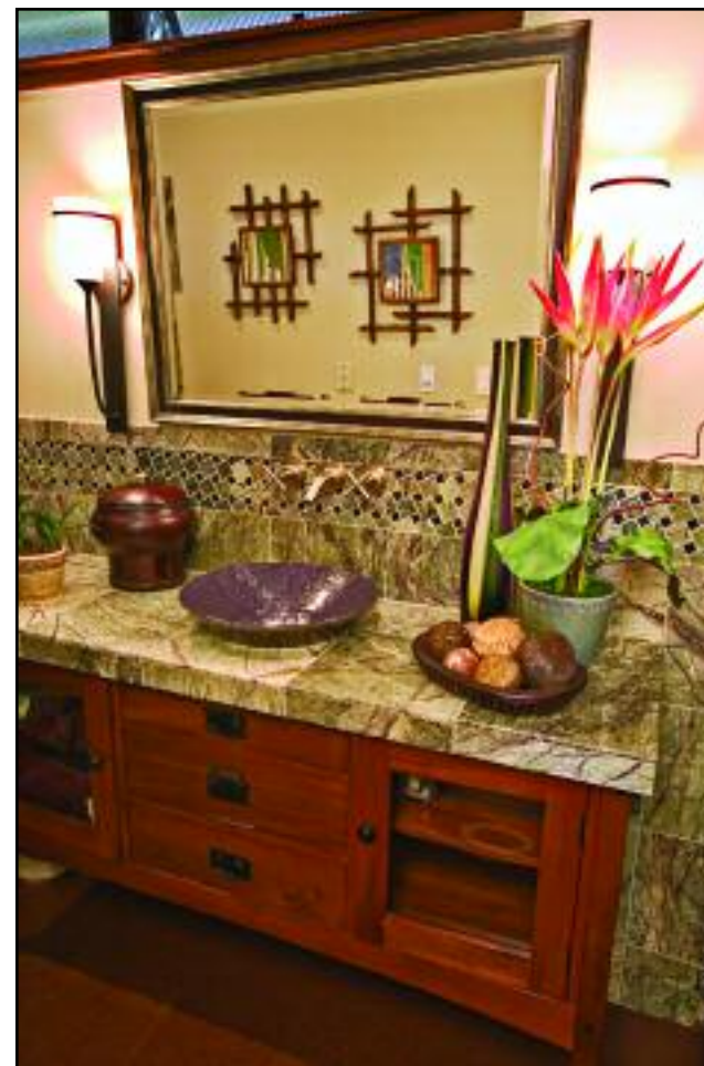
BELOW: In one of the bathrooms Birtcher repurposed an existing dining buffet into a vanity. The vessel sink and faucet are from Kohler. The tile/granite is Rainforest.